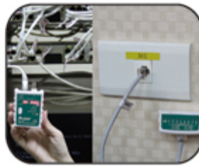
RJ45 cable test