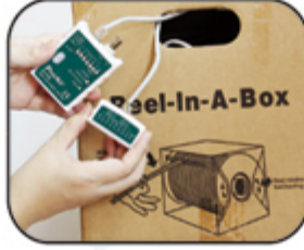
Long cable test more than 300m