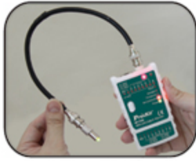
BNC cable test