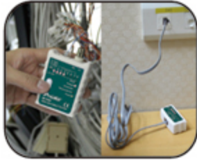
RJ11 cable test