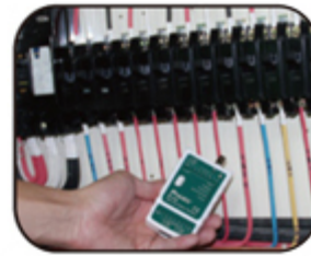
Non-contact voltage detection