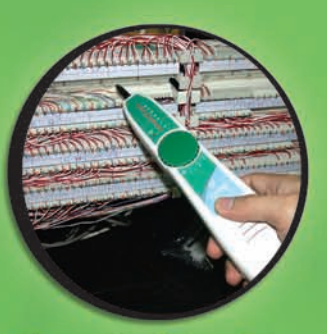
Locate & isolate cables